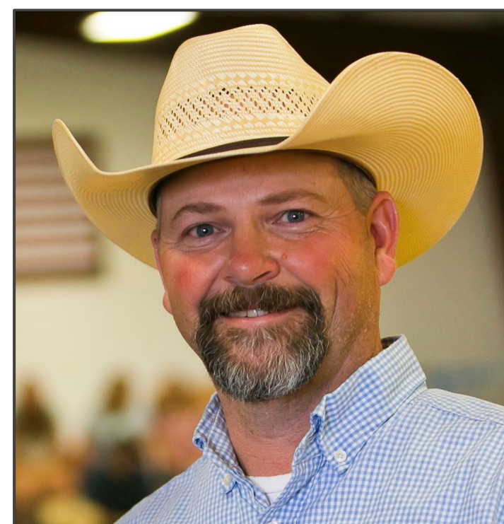
Eric McPhail Extension Field