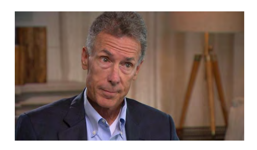
Mike Moore Law Firm