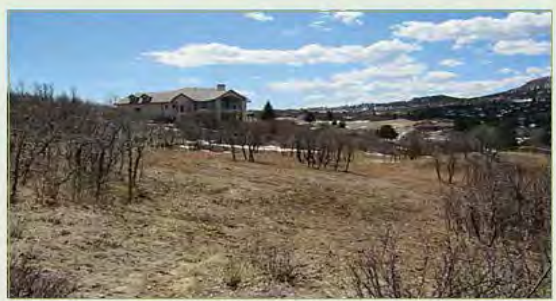
Before (top) and after (bottom) fuels treatments near a residence at Keene Ranch